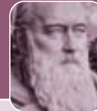
Theodor Billroth, the great Viennese surgeon