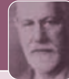
Sigmund Freud, the father of psychoanalysis