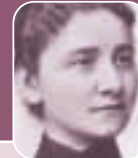
Gabriele Possaner v. Ehrenthal, the first female doctor in Vienna